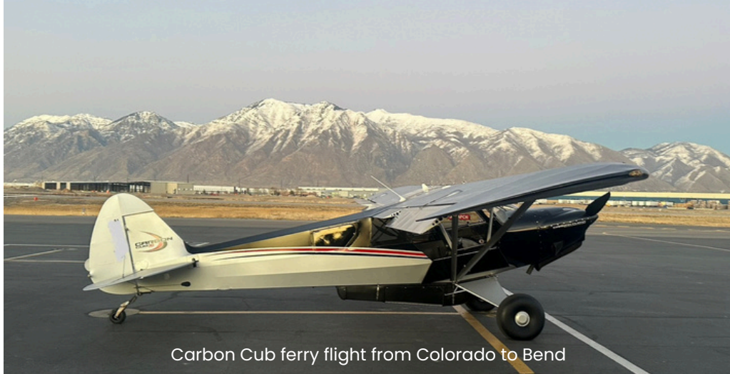
Carbon Cub ferry flight from Colorado to Bend